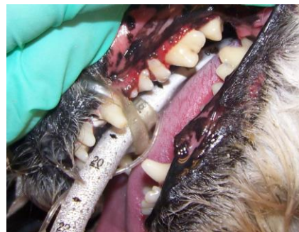
Tilly's teeth after professional dental cleaning