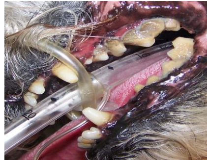
Tilly's teeth before professional dental cleaning

If needed, ultrasonic scaling of your pet’s teeth and polishing will occur under carefully monitored anesthesia. Antibiotics and pain medication may be dispensed if required.